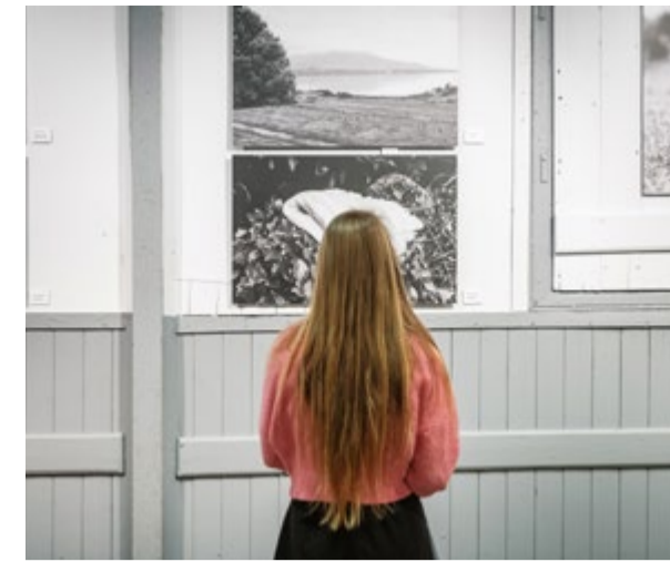
Bere island Arts Festival, HOLD exhibition

until the stream runs dark with what needs to blacken out of you.